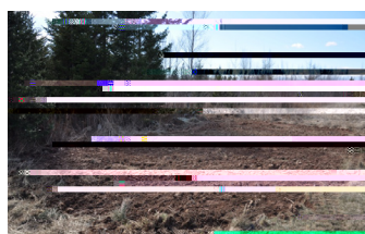
Roto-tilling is usually sufficient for most gardens, and saves labour. However, be careful not to over-till, as this can destroy soil structure.

Fall tilling alone is not recommended for hillside or steep garden plots, since soil is left exposed all winter, subject to erosion when spring rains come. If a winter cover crop is grown to improve soil and prevent erosion, the ground will have to be tilled in the fall to prepare the soil for seed and again in spring to turn under the green manure. Spring cultivation is better for sandy soils and those where shallow tilling is practiced.